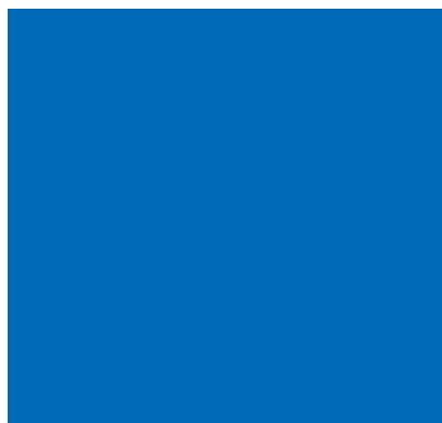
Pantone 293 C