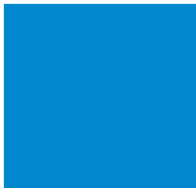
Pantone 3005 C