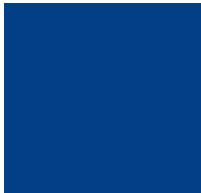
Pantone 2758 C