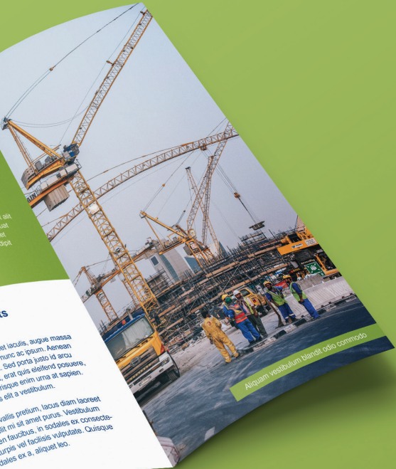
Aliquam vestibulum blanditi odio commodo

Sed mattis, massa et convallis pretium, lacus diam laoreet diam, ac condimentum elit mi sit amet purus. Vestibulum tristique mauris a sapien faucibus, in sodales ex consectet. Phasellus auctor turpis vel facilisis vulputate. Quisque eget lorem porta, sodales ex a, aliquet leo.